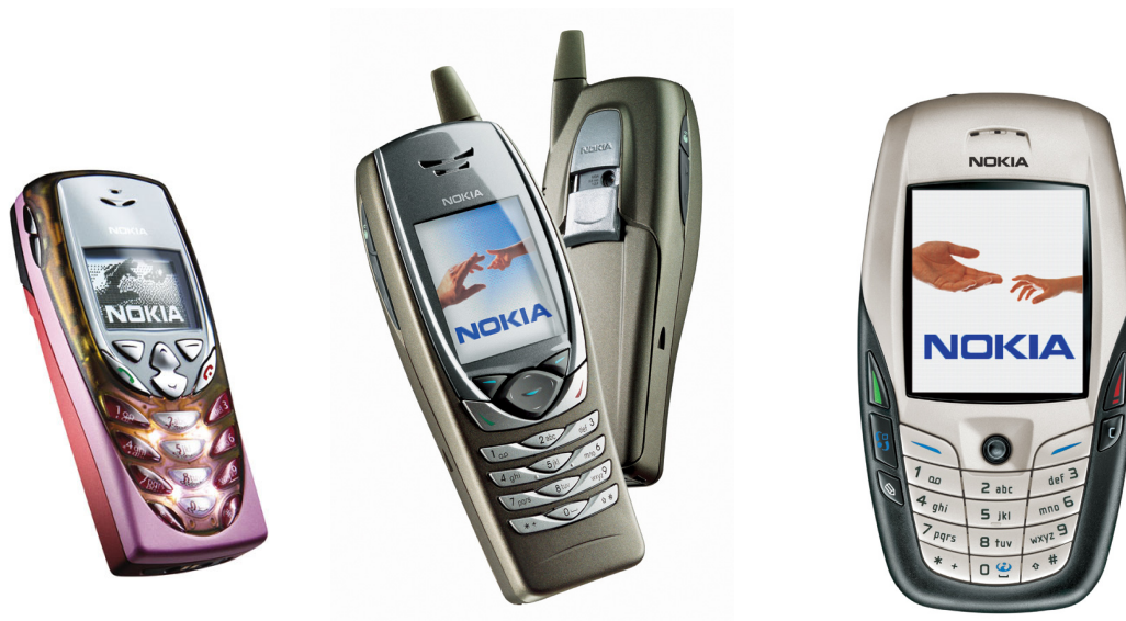
Figure 1.1: Nokia 8310, Nokia 6650, and Nokia 6600

This document describes the attention (AT) commands that can be used with Nokia GSM (including also DCS1800 and PCS1900) and Wideband CDMA (WCDMA) products available after autumn 2001, including, for example, the following products: Nokia 8310, Nokia 6310, Nokia 7650, Nokia 8910, and Nokia D211. A short description, the syntax, the possible setting values, and responses of the AT commands are presented.