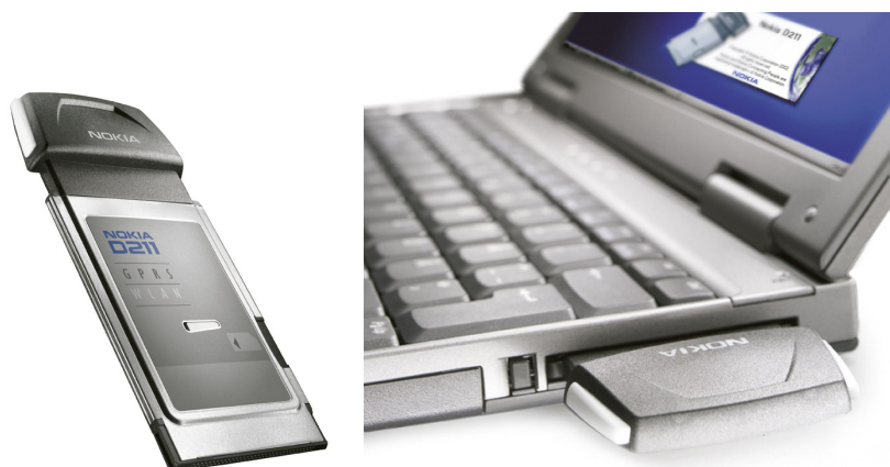
Figure 1.3: Nokia D211

Computers use AT commands to communicate with modems. Most communications applications, however, have a user interface that hides the AT commands from the user. AT commands can be issued via a communications application. When the software in the Nokia product has received an AT command, it responds with a message that is displayed on the screen of the used device, which can also be the mobile phone.