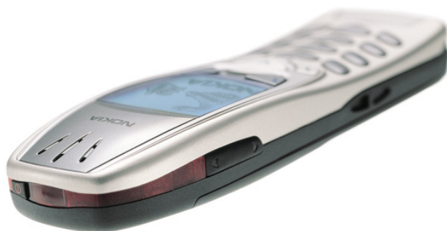
Figure 1.2: Nokia 6310

Some AT commands are not supported by all Nokia products or by all operators. Giving a command that is not supported by the product causes an error response. Some Nokia products do not necessarily support all command parameters and using the unsupported parameters causes an error response.