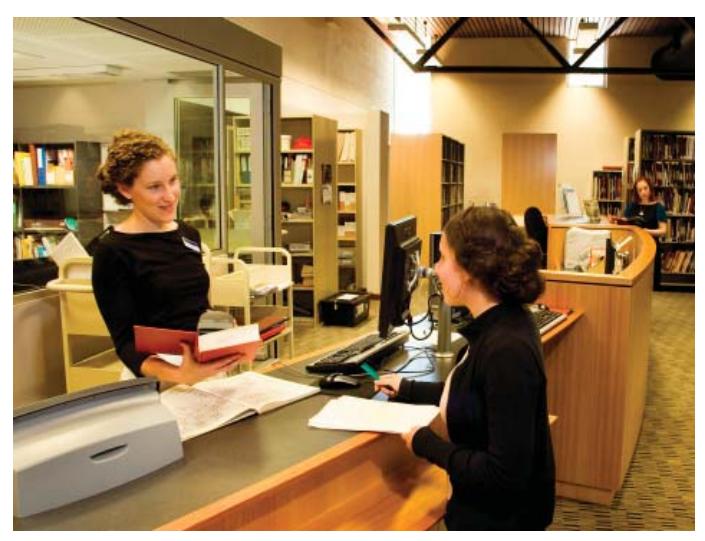
The loans desk and staff work area at the Music Library.