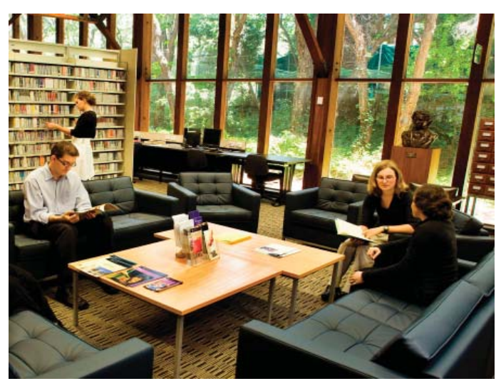
The open reading area with casual seating