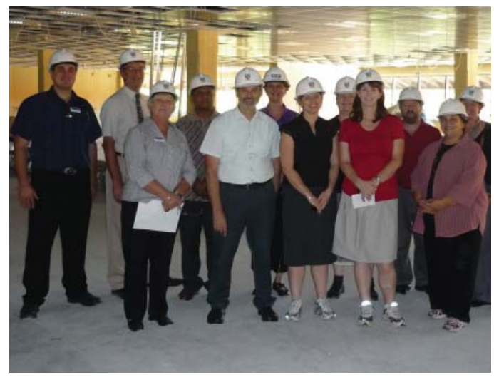
Hard Hats essential!

The Science team were recently taken on a tour of the new building to see the progress first hand.