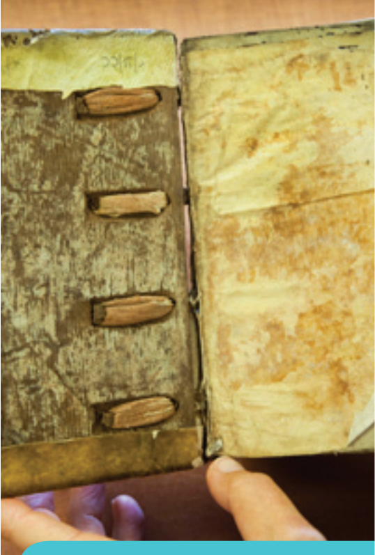
The leather binding of The Formulary

We've learned a great deal about the collection and the Library system. It has also provided a great opportunity to rethink the way we would like to do some things in terms of collection management. It's certainly wiped the slate clean in many respects. While there is always some uncertainty and anxiety in these situations, there are enormous positives and the focus is now clearly on those.