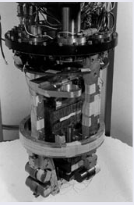
The gravity gradiometer stands close to two metres tall and weighs 200 kilograms

"They spent at least $10 million over the next few years, but also threw another spanner in the works. Although our gravity